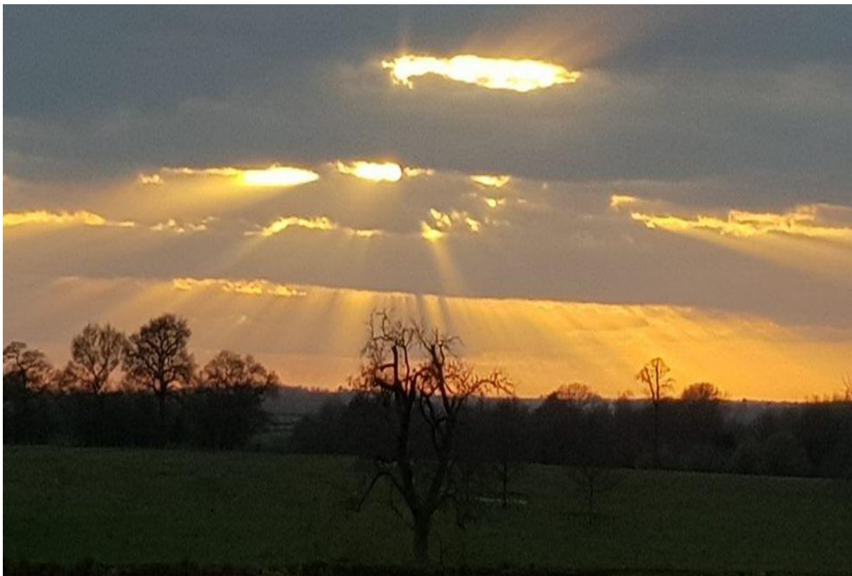
View of grounds in sunset, Claydon Estate, Buckinghamshire